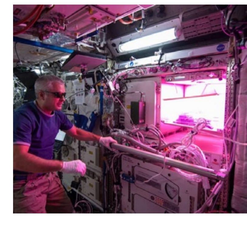
Fig. 1. International Space Station crew member, Dr. Steve Swanson tending the Vegetable Production System (Veggie) on ISS during Expedition 40. Veggie is a plant growth system installed on ISS which uses a LED lighting system that is designed to produce salad-type crops to provide the crew with fresh food while on orbit.

In preparation for human colonization of space, NASA beginning integrating a food production system for production of continuously produced fresh vegetables to increase the quality of crew diets. This operational system is required to fit into an existing habitat, and not interfere of ongoing work, science and living operations. Various designs were incorporated in the NASA's Deep Space Habit and deployed at NASA Desert Research and Technology Studies (DRATS) test site. A design of automated watering, and LED lighting were incorporated into an atrium area between the laboratory and living modules and mizuna, lettuce, basil, radish and sweet potato grown, with eating the radishes and leafy greens.