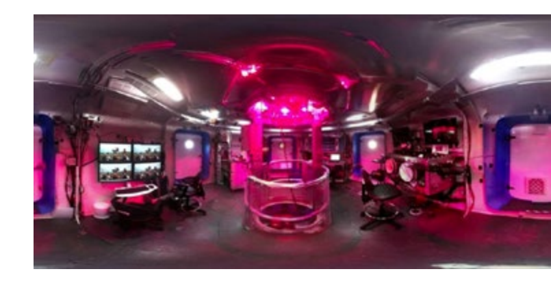
Fig. 3. Wide angle view of NASA's Habit Demonstration Unit work laboratory showing effect of red/blue LED's positioned in plant atrium.