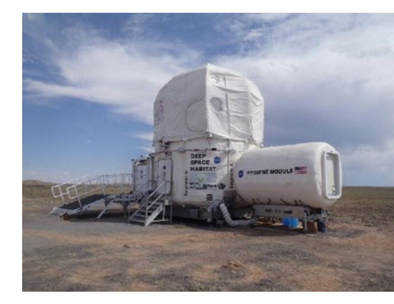
Fig. 2. NASA's Deep Space Habitat Module on location for field testing in Arizona Desert. A food production system was integrated as an atrium between the living (upper) and working (lower) areas.

NASA supported research use of LEDs to grow plant in space in the late 1980's laid the groundwork for the